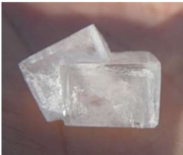
Photo 1. Searles Lake, CA prismatic halite.

Here is a common Searles halite prismatic crystal form (Photo 1). These are not cubes.