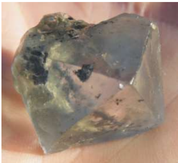
Photo 2. Searles Lake, CA octahedral halite. It was attached to mud in the back that probably includes some hanksite, making that green.

Within the isometric group is also the octahedral form. Here is a Searles Lake octahedral halite (Photo 2). This was sold as sulfohalite, but infrared confirms this is halite with no sulfate.