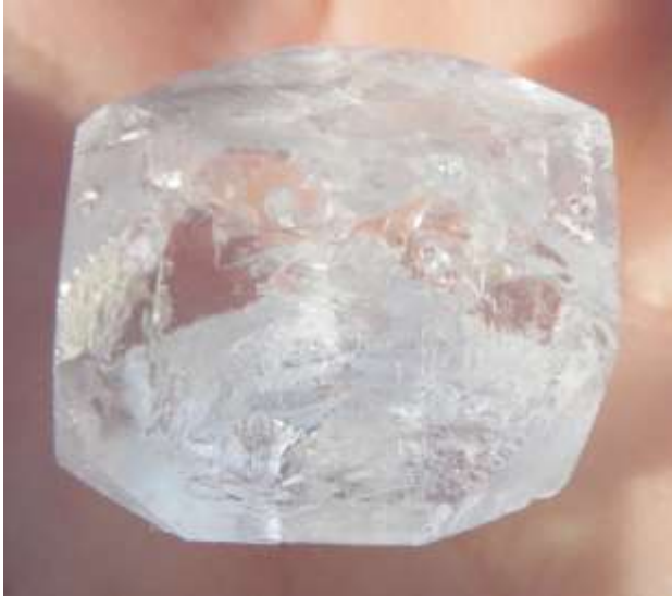
Photo 3. Searles Lake, CA prismatic-octahedral crystal.

There are mixed forms of cubic and octahedral, and for Searles Lake, also prismatic-octahedral. This makes a prism with cropped corners (Photo 3).